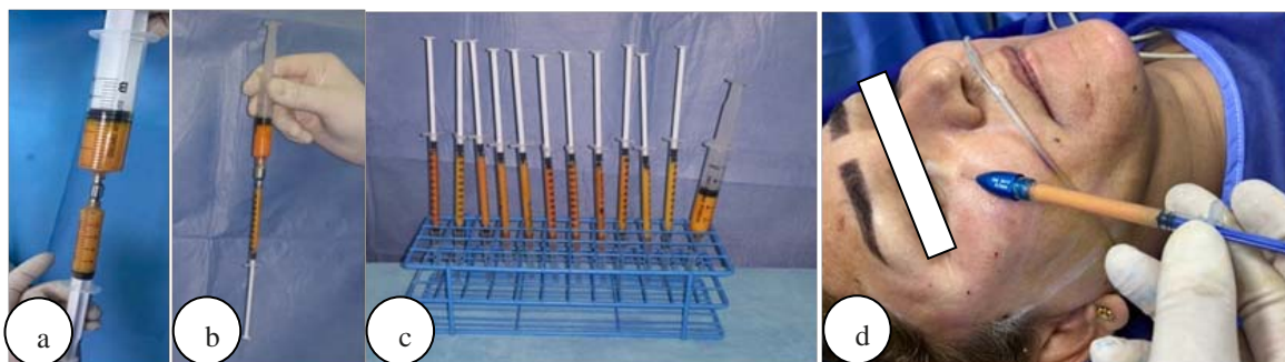
Figure 2 a,b- The pure fat is transferred into a 10 ml syringe and then to one ml syringes to be ready for fat grafting, c- Fat graft in 1 ml syringes, d- Fat grafts are injected using a one ml syringe connected with a blunt fat injection cannula.