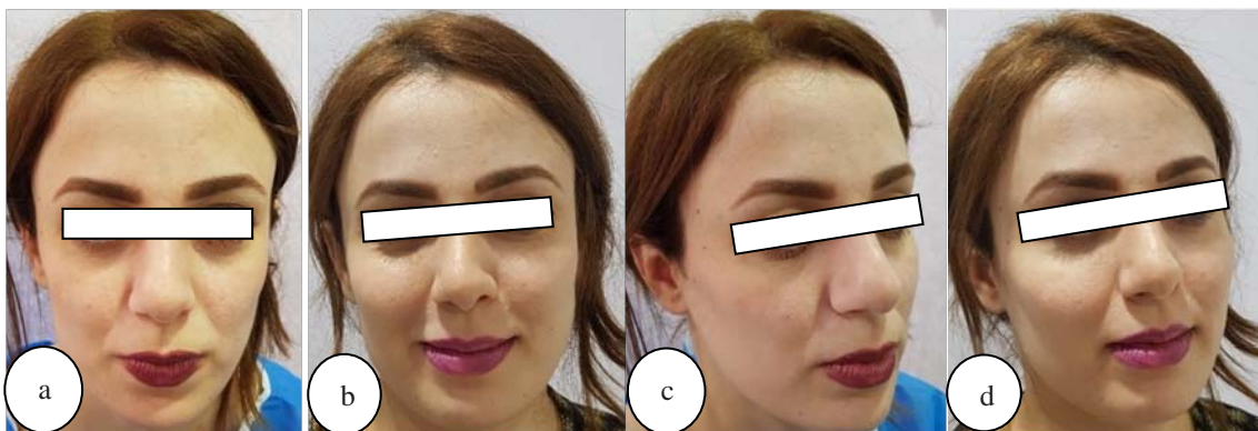
Figure 4 a,c: Before facial fat grafting. b,d: Three years after one session of facial fat grafting shows good improvement of facial appearance.