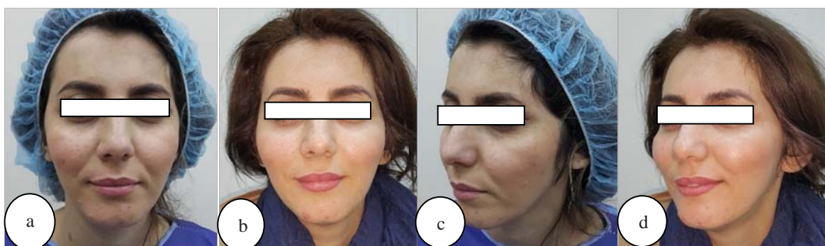
Figure 5 a,c: Before facial fat grafting mixed with PRP. b,d: Four years after one session of facial fat grafting mixed with PRP shows a great improvement in facial appearance and skin brightening.