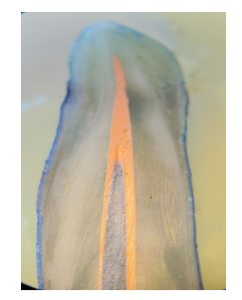
Figure 2: Stereomicroscopic evaluation (Smear layer, thermafil)

group scores at p> 0.05, except there was significant difference between smear layer groups compared smear layer free when obturated by theramafil. Also there was significant difference when lateral compaction technique compared with the thermafil technique in smear layer free group scores at p< 0.05, (table 3, 4 and Figure 4).The best results obtained from smear layer group when obturated by thermafil and smear layer free group when obturated by lateral compaction technique.