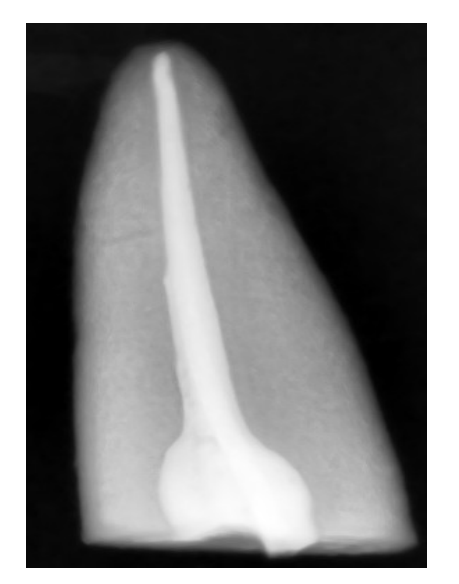
Figure 1: Radiographic evaluation (Smear layer free, thermafil)

By using paired t- test, generally, there was non-significant difference between the