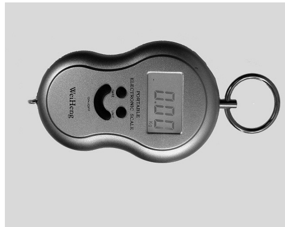
Figure 1: Digital force gauge.

0.05 mm stainless steel strip could be inserted with some resistance, but a 0.11 strip could not. 10 The technique of measuring the proximal contact strength is based on the concept of frictional forces as described by Southard et al. 11 , Osborn 12 , Southard et al. 13 The frictional force between teeth was recorded by a 0.05 mm thick stainless steel strip (3x25 mm) which was slipped between the teeth and withdrawn with a digital force gauge (Figure 1).