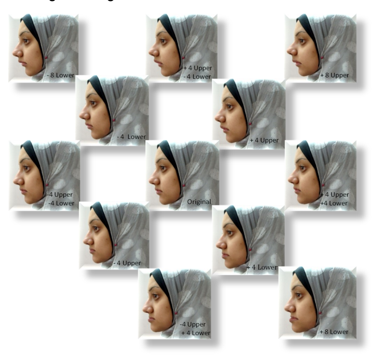
Figure 2-B: The female altered profile images arranged in a sequence due to the amount of alteration from the original image.