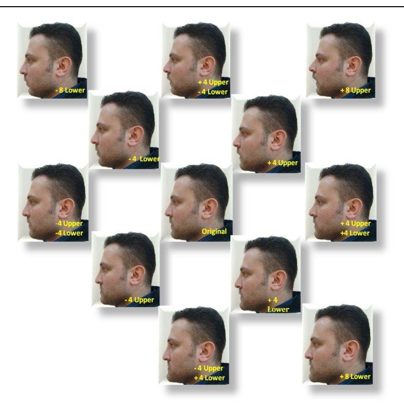
Figure 2-A: The male altered profile images arranged in a sequence due to the amount of alteration from the original image.