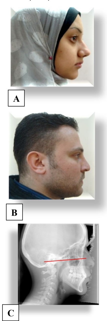
Figure 1: Profile digital image of: a female volunteer (20 years old, A) and a male volunteer (25 years old, B), both with pleasant and straight soft tissues profile and average proportions. Movements (C) were tracked relative to Frankfort Horizontal reference plane.

and scanned cephalographs were combined and superimposed.