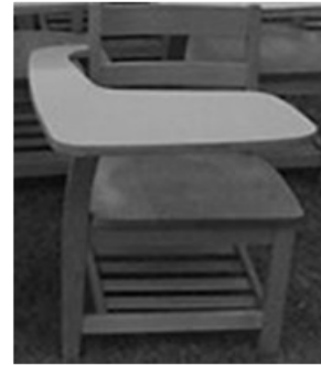
Figure 2: wooden desks.

were studied during two hours midterm exam. A self designed questionnaire (not previously validated) was used to collect what is thought to be factors possibly influencing the adoption of a particular posture. The following variables were studied; height, weight, dominant hand, gender, posture during the two hours exam (particularly the lumbar spine and the cervical spine), the presence or absence of back pain and the sport's activities of the students. The posture of the student was observed by looking at the side (right and left, unless sitting next to the wall), the front and the back of each student, every 30 minutes (3-4 times) and a particular type of the posture was labeled when the type of posture was recorded at least 3 times during the examination period. The mean height±SD of the students was 170±12.2 cm and the mean±SD weight was 72±6.7 kg. The posture was divided into type I where the lumbar spine was extended; type II with the lumbar spine straight, and type III where the whole trunk was flexed forwards as shown in Figure 1. The seats used were wooden and a writing mobile table situated on the right side of the chair was available (Figure 2). The height of the seat was 42 cm. All the seats were for the right handed, where the desk was situated on the right side with a hinge tilting upwards. Statistical analysis: An online statistical calculator was used to obtain the standard deviation and p value using (ADaMSOft – statistical package for statistical analysis).